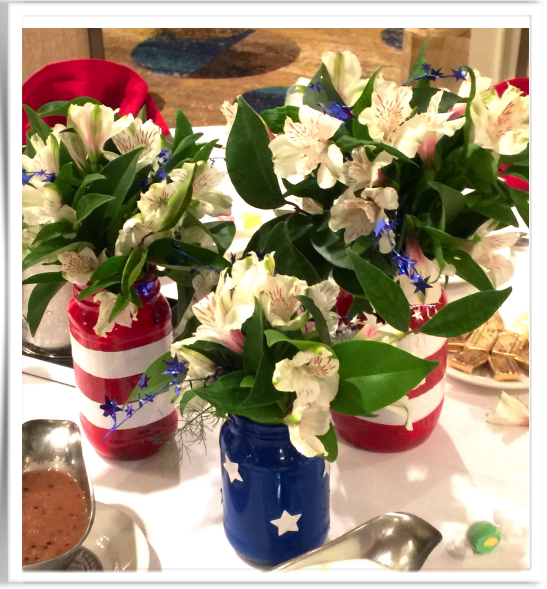
Flowers show off repurposed and recycled mason jars painted in red, white and blue for patriotic theme.

LBGC hosts Wednesday's dinner and decorates table(s).