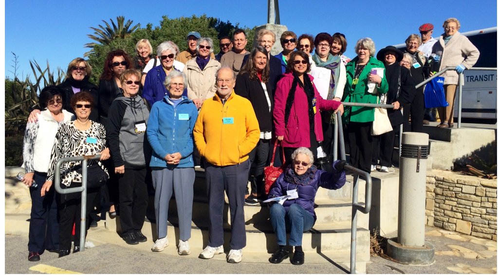
Tour group of 30 at San Vicente Interpretive Center.