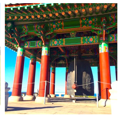
Korean Bell ~ a gift to the City of San Pedro from Korea.