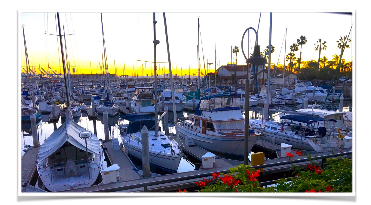
View of the sunrise at the Double Tree Hotel in San Pedro. The enchanting location of the marina was one of the many reasons the Winter Board was so enjoyable and successful.