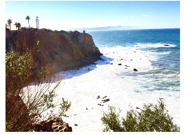
Pt. Vicente Lighthouse as viewed from the SVI Center. Catalina Island was clearly seen 27 miles across the sea on this picture perfect day.